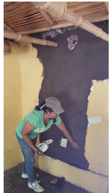
The straw bale staff house at the Training Center has been repaired and will soon be painted.